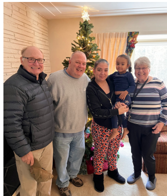
Thank you to St. John's and St. Ben's Catholic Churches Giving Tree Support!

SON Twin Ports is looking for a Co-Program Manager position, SON IR & TWP need care coordinators and volunteers, please email your resume to togetherforlifeforthland@gmail.com .