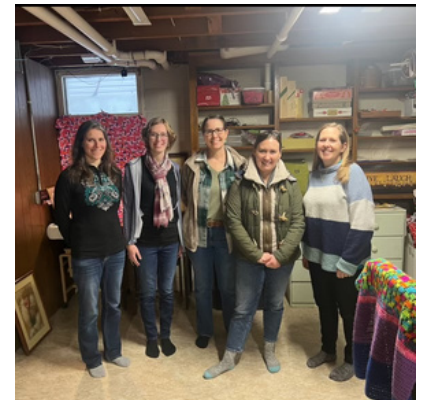
Thank you to teacher volunteers from Stella Maris who cleared and created our craft room for our Moms.